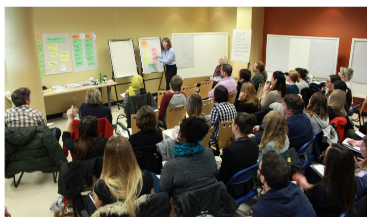
Pre-Symposium workshop on "Mitigating gender bias in science"